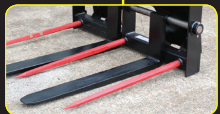
PALLET FORK & HAY SPEAR COMBO

Talk to an expert today! www.normeng.com.au