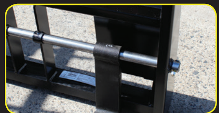
PIN EYE PALLET FORKS