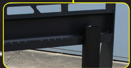
CARRIAGE STYLE PALLET FORKS