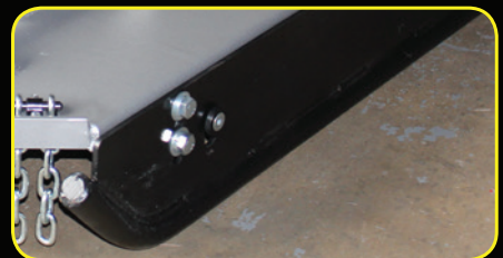
ADJUSTABLE SIDE SKIDS