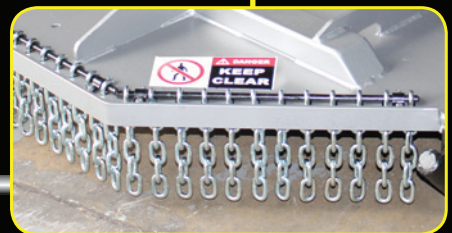
CHAINS FRONT & REAR