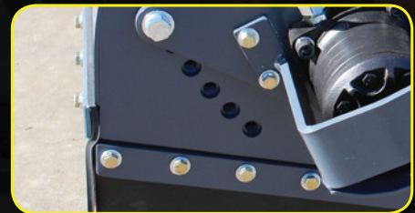
UNIQUE ROBUST BRUSH ADJUSTMENT SYSTEM