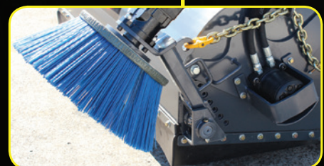
GUTTER BRUSH OPTION